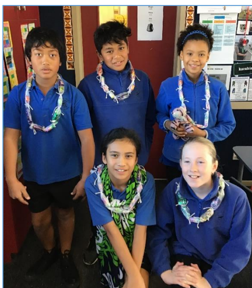
Tamaiti wearing their lolly necklaces