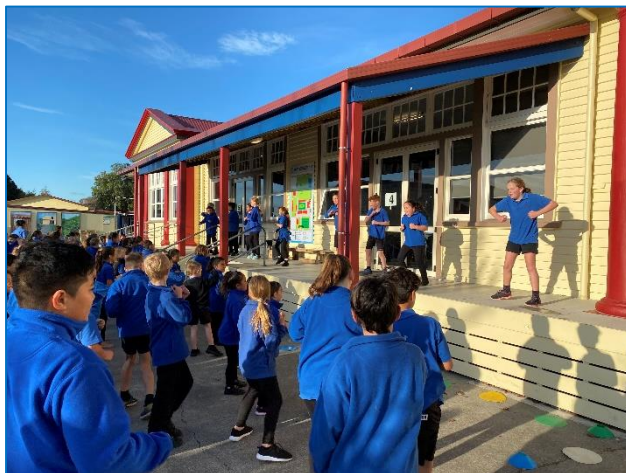
Children enjoying Jump Jam again