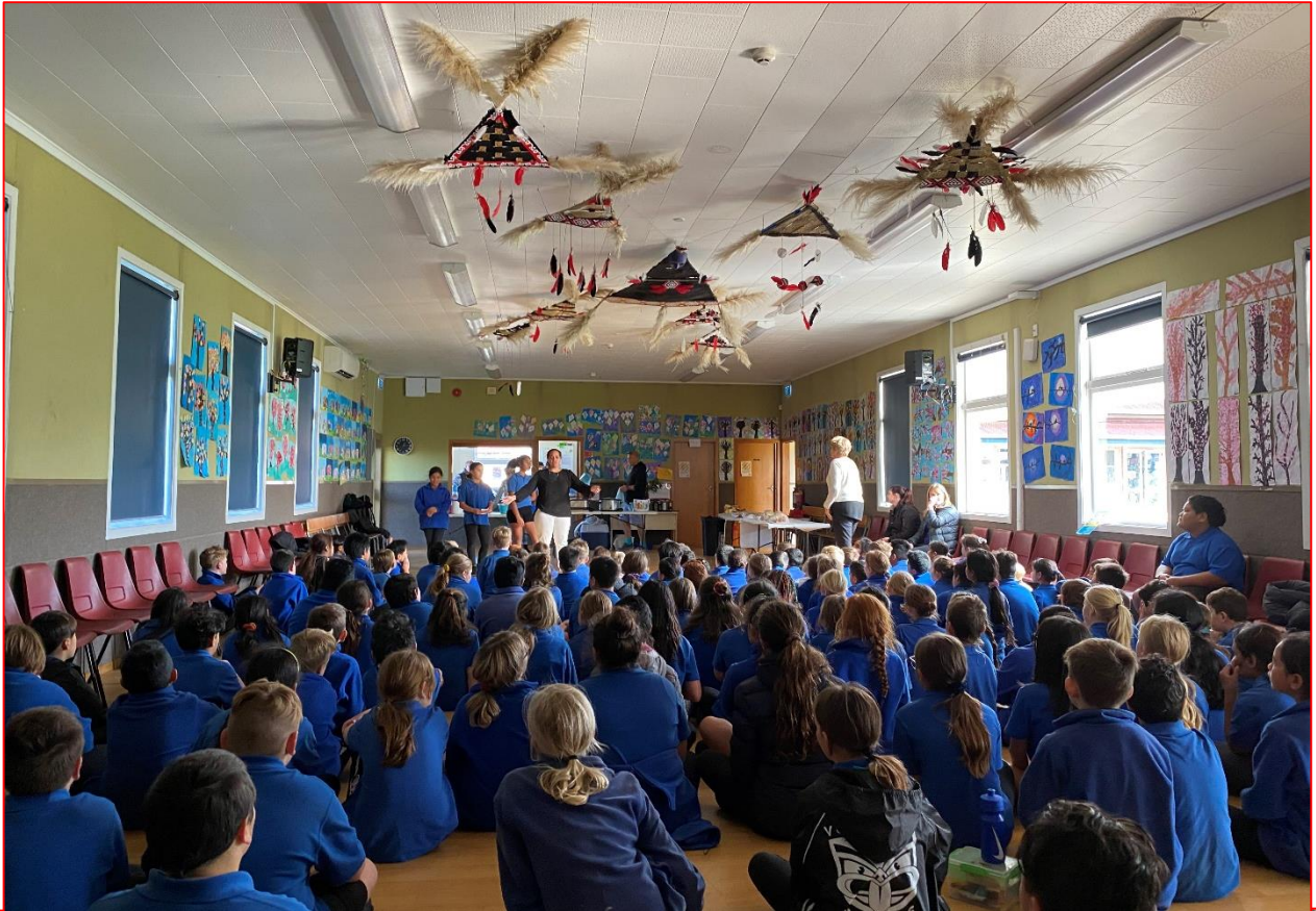
TE IWA O MATARIKI The nine stars of Matariki